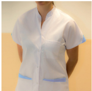
Hospital service agent