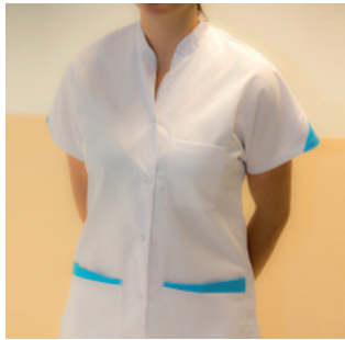
Care assistant / Childcare assistant